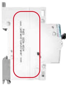
Improved air channels