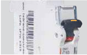
COPYTRACER Anti-counterfeit registration number