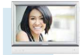
10" Touch screen internal unit