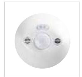
Dual Technology 360° Sensor