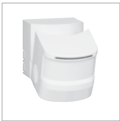
PIR 180° Sensor