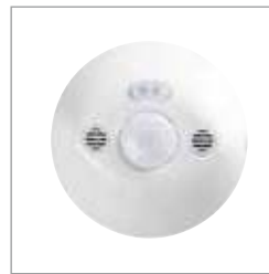
Ultrasonic 360° Sensor