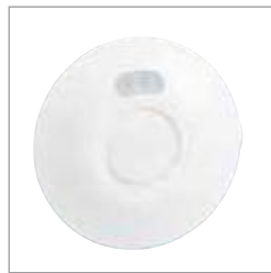
PIR 360° Sensor