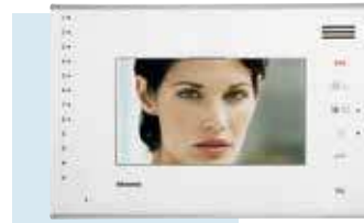
Slim 7" wide screen with alarm function

The D45 system simplifies installation in residential spaces right from a single house to a group of houses to residential complexes with a large number of apartments.